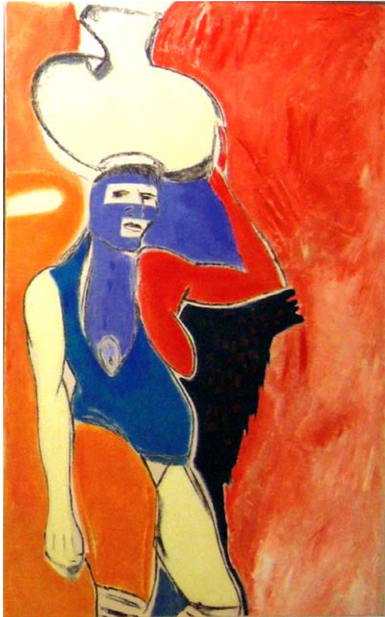
Amertrinity (detail) Acrylic on canvas, 63" x 140" (1994)