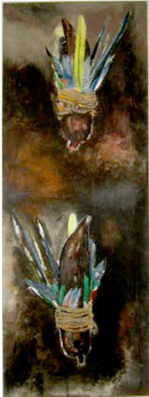
Yuca Zemí – Feathers Bundle Acrylic on canvas, 54” x 20” (1991)