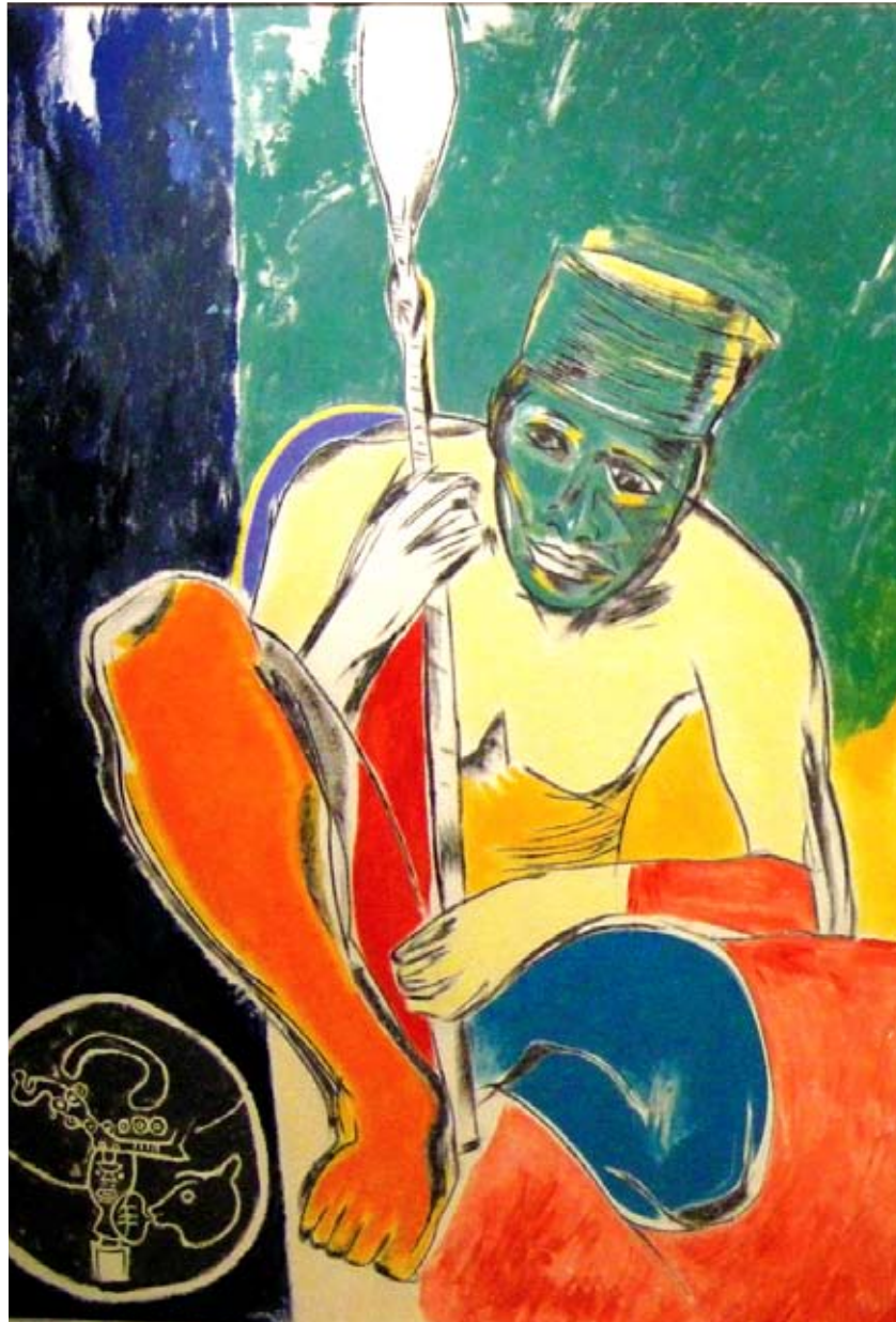
Amertrinity (detail) Acrylic on canvas, 63" x 140" (1994)