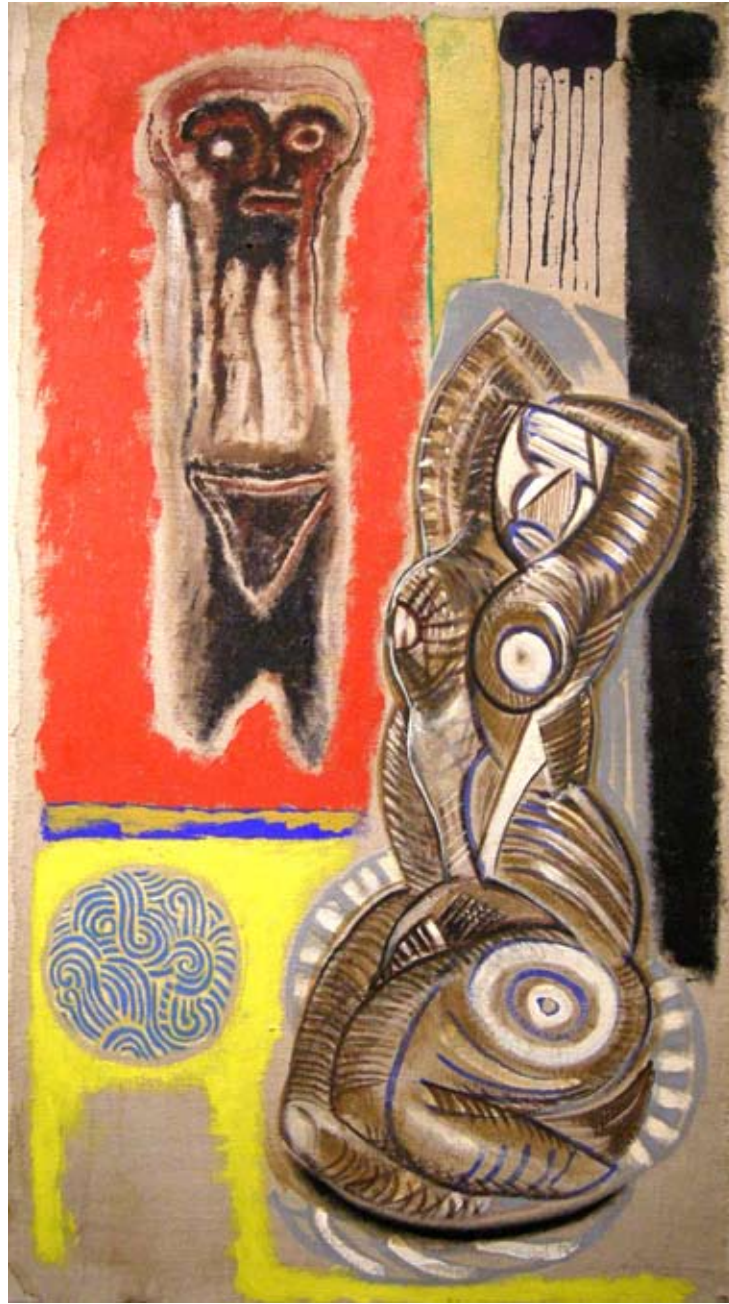
Atabeira and the Apparition Acrylic on canvas, 28" x 50" (1990)