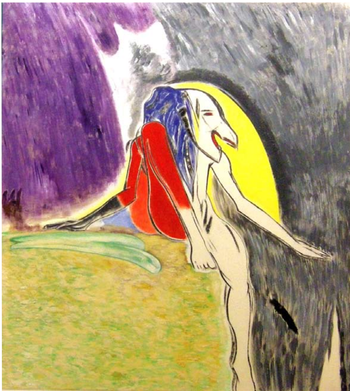
Amertrinity (detail) Acrylic on canvas, 63" x 140" (1994)