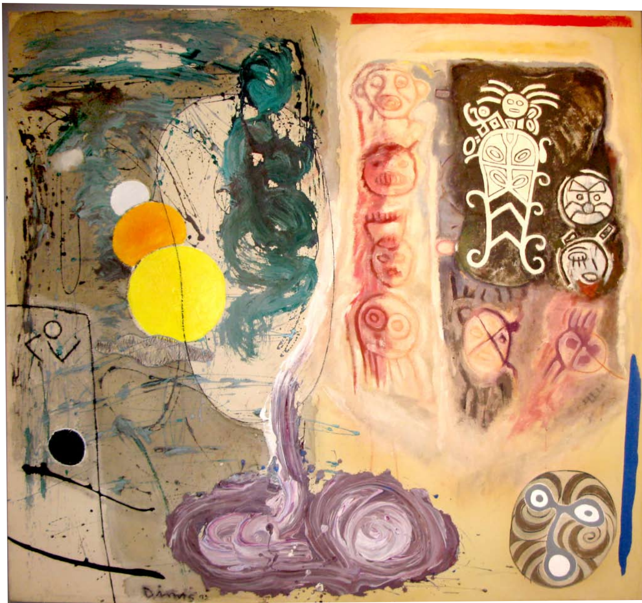
La Mancha - Spotted Moon Acrylic on canvas, 56" x 60" (1993)