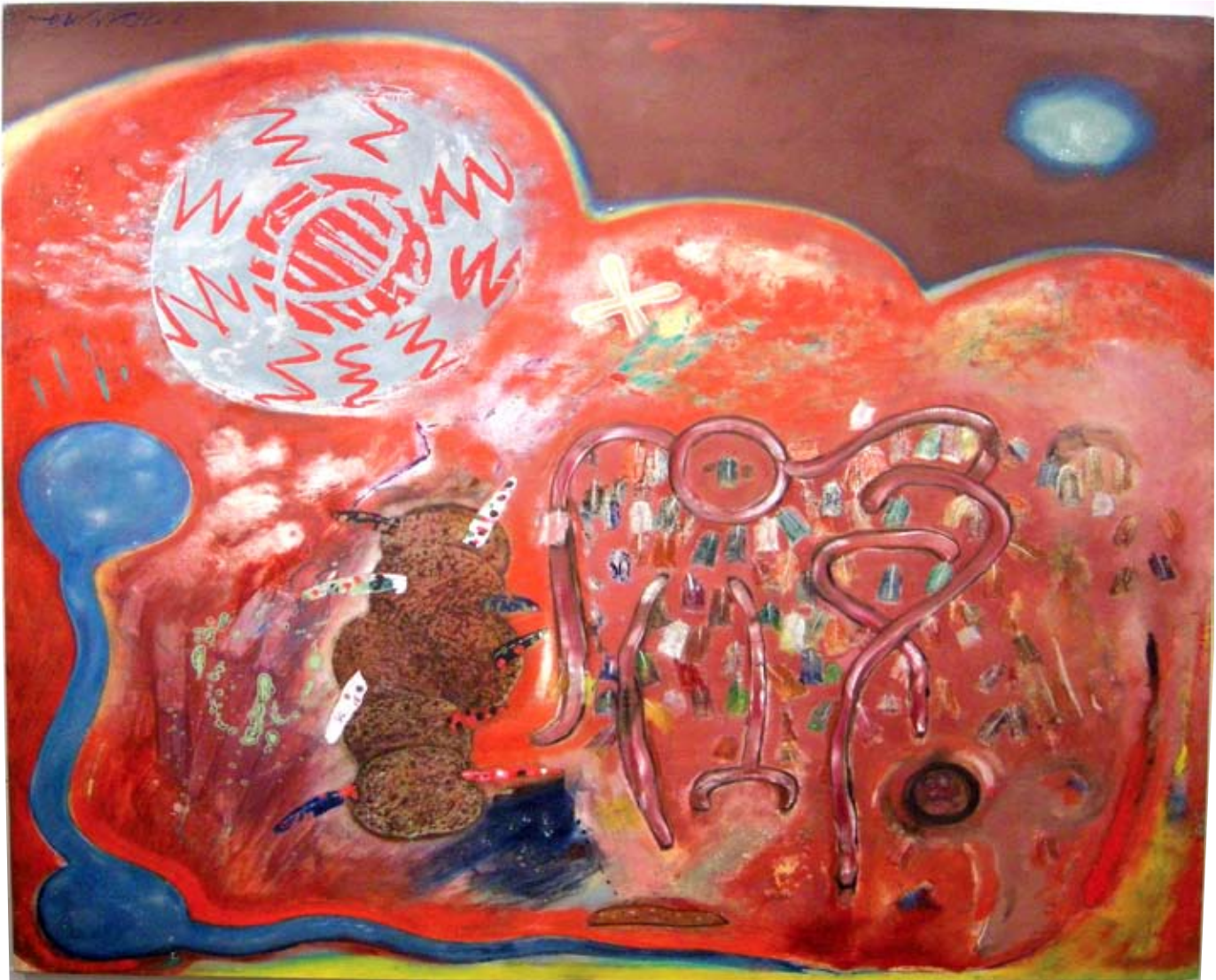
Los Otros / The Others Oil on linen, 58" x 62" (1972)